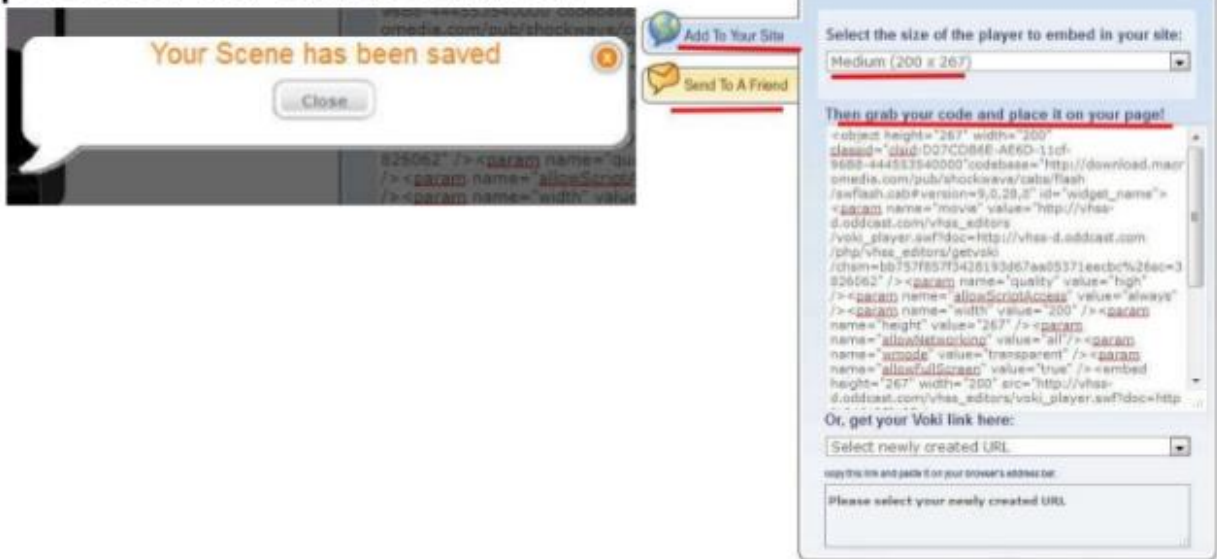
Image has been saved. Various links will appear. The links will allow your voki to posted or embedded.