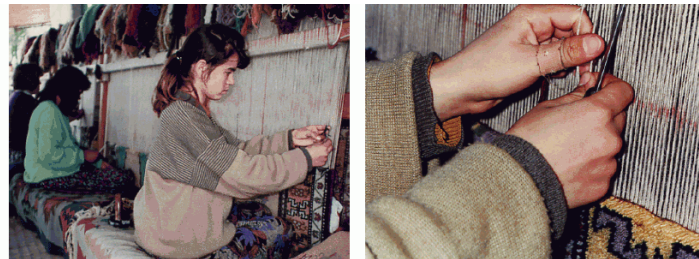
Figure 4 Matched action shots

Consider a shot from behind a pitcher throwing a fastball. The pitcher releases the ball and then it smacks into the catcher's glove. Instead of a single shot, grab three shots: a medium shot from behind the pitcher making the pitch, a shot from behind the catcher of the ball in flight, and a tight shot of the catcher's glove. Use the same concept for an artist: get a wide shot as the artist applies a stroke to the canvas and then move in for a close shot of the same action. You'll edit them together to match the action ( Figure 4 ).