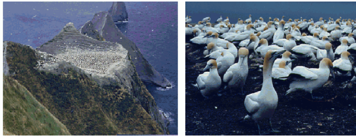
Figure 1 An establishing shot (left) sets the scene and the second shot tells the story.

An establishing shot sets the scene in one image ( Figure 1 ). Although super-wide shots work well (aerials in particular), consider other points of view: a race seen from the cockpit, a close-up of a scalpel with light glinting off its surface, paddles dipping frantically in roaring white water. Your picture should grab the viewer's attention and help set up your story.