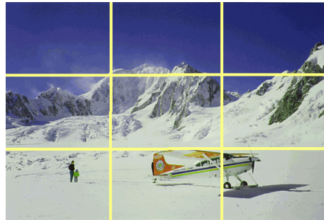
Figure 2 The rule of thirds

Another way to follow the rule of thirds is to look around the viewfinder as you shoot instead of staring at its center. Check the edges to see whether you're filling the frame with interesting images. Avoid large areas of blank space.