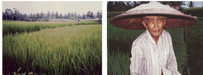
Figure 3 Wide shots and tight shots

Our eyes work like medium-angle lenses, so we tend to shoot video that way. Instead, grab wide shots and tight shots of your subjects ( Figure 3 ). If practical, get close to your subject for the tight shot rather than using the zoom lens. Your shot will look better and the proximity will give you clearer audio.