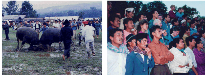
Figure 5 A crowd reaction shot works well as a cutaway from this bloodless bullfight in Sumatra.

The same holds true for a sports event ( Figure 5 ). Cutting from one wide shot of players on the field to another can be disconcerting. If you shoot the scoreboard or some crowd reactions, you can use those cutaways to avoid jump cuts.